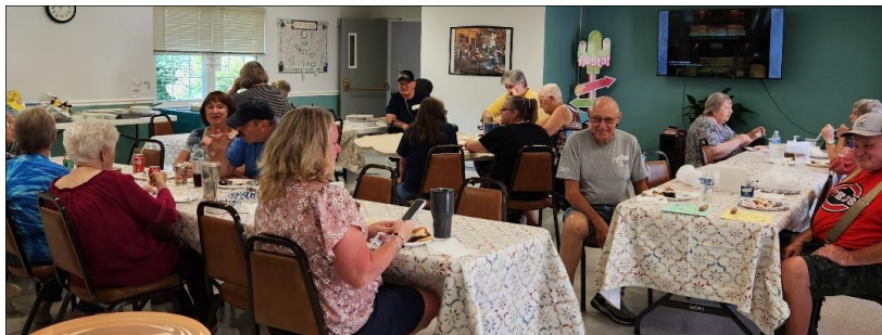
There was a lot of good food and big laughs at the most recent resident pitch-in!

Come share your ideas for further projects at the resident's meeting on Tuesday August 15th at 1 o'clock in the Multi Purpose Room. Remember YOU are the resident association. See you there.