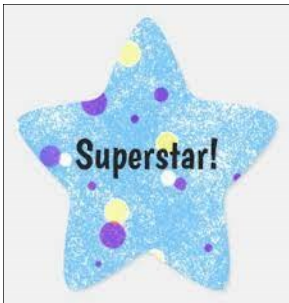
A big “thank you” to this months’ superstars!