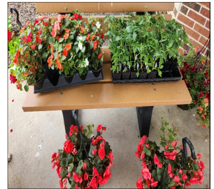
Some of the plants available at the recent sale.