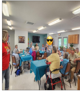
The food at the recent resident pitch-in was

Websites for Southview Courts, the Union County Council on Aging and Aged and the Union County Transit are in the works and expected to go live soon! Calendars and Newsletters will be available online. Residents will still receive paper copies each month, but they will also be available to you online.