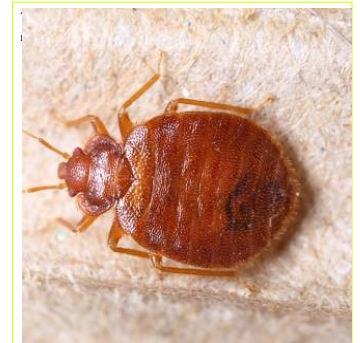
An enlarged photo of the ever elusive bed bug

Bed bugs can be picked up anywhere by anyone so always keep an eye out for signs of bedbugs and report any concerns to management so that we can continue to keep SVC's free of bedbugs!