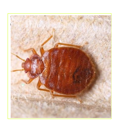
An enlarged photo of the ever elusive bed bug

Bed bugs can be picked up anywhere by anyone so always keep an eye out for signs of bedbugs and report any concerns to management so that we can continue to keep SVC's free of bedbugs!