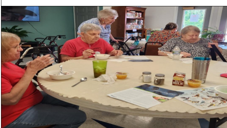
Everyone at the ice cream social agreed we should do this more!