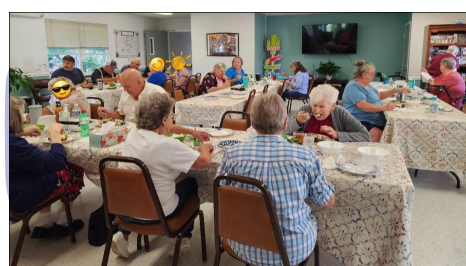
The baked potato bar was a delicious success enjoyed by many

On Saturday Sept 23rd there will be chili, donuts and cider sponsored by the resident council. More info to come!